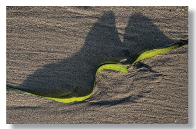
17-Scoulers Surfgrass, Phyllospadix scouleri.jpg Janet Azevedo

Good detail, lacks key area of interest. Perhaps a tighter crop would improve the image.