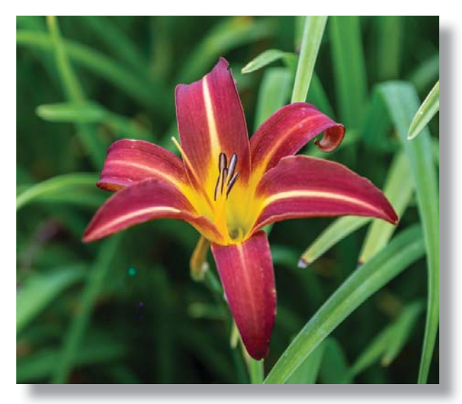
13-Orange Day Lily.jpg