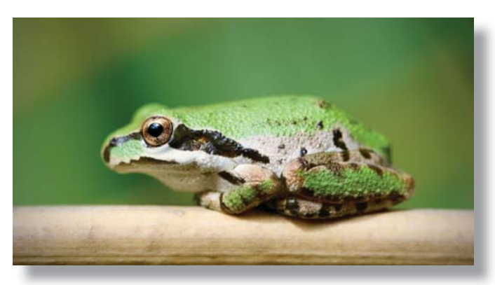
14-Pacific Tree Frog.jpg