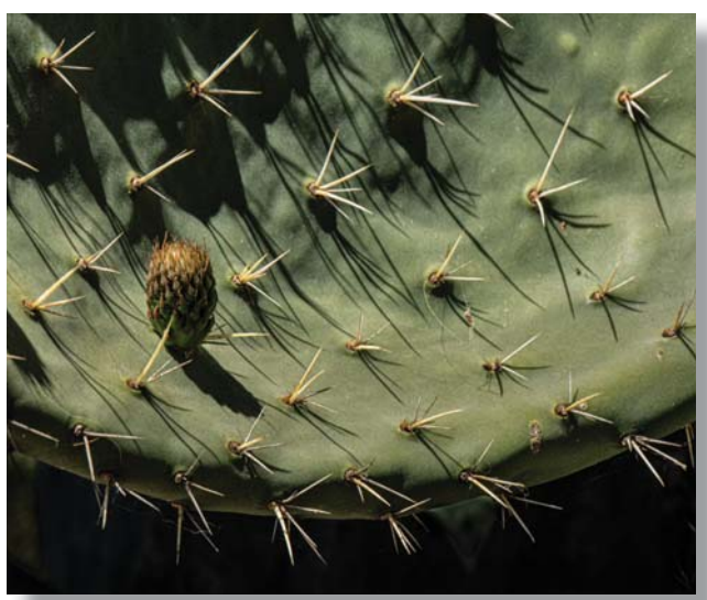
16-Prickly Pear, Opuntia humifusa.jpg Janet Azevedo Good detail, lacks key area of interest. Perhaps a

Good detail, lacks key area of interest. Perhaps a tighter crop would improve the image.