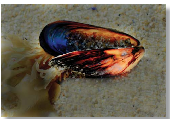
18-Setting Sun Shines on a Mussel Shell.jpg Carol Fuessenich

Interesting image with good detail. Would be improved if the main subject was more in focus. ***