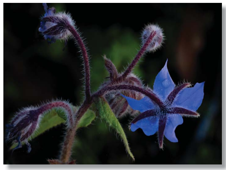
Blue Flower with Friends Chritina Parson